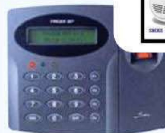
Biometric Time Attendance